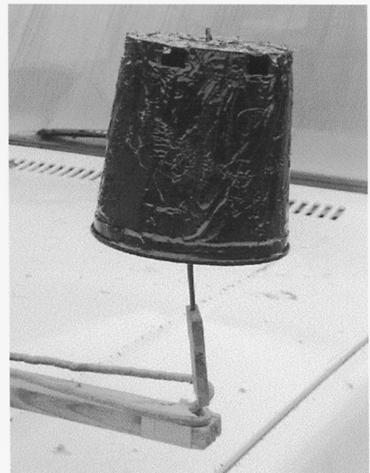
Fig. 1. The “trolling” deerfly trap: A. truck-mounted apparatus used in experimentation, B. cup version mounted on cap for personal protection and C. individual trap that can be mounted on a lawnmower, 4-wheeler or other vehicle to suppress deer flies from dooryards and other locations.

traps of each color were used and the pots of the 3 colors were grouped in two sets to begin the first replicate then randomized as described above.